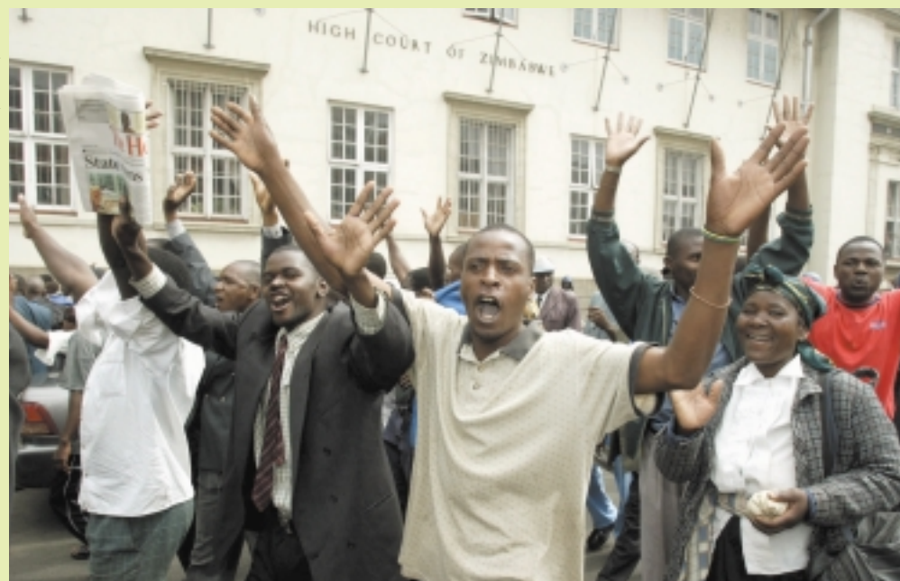
Supporters of opposition leader Morgan Tsvangirai outside the High Court in Harare. Initiatives like the Zimbabwe Social Forum are now promoting alternative approaches to grassroots democracy.

democracy where communities control the decisions that affect them and the resources around them. This is democracy that doesn't rely on distant 'leaders' but empowers communities to run their own lives with community assemblies and committees in charge of everything from their water to their schools.