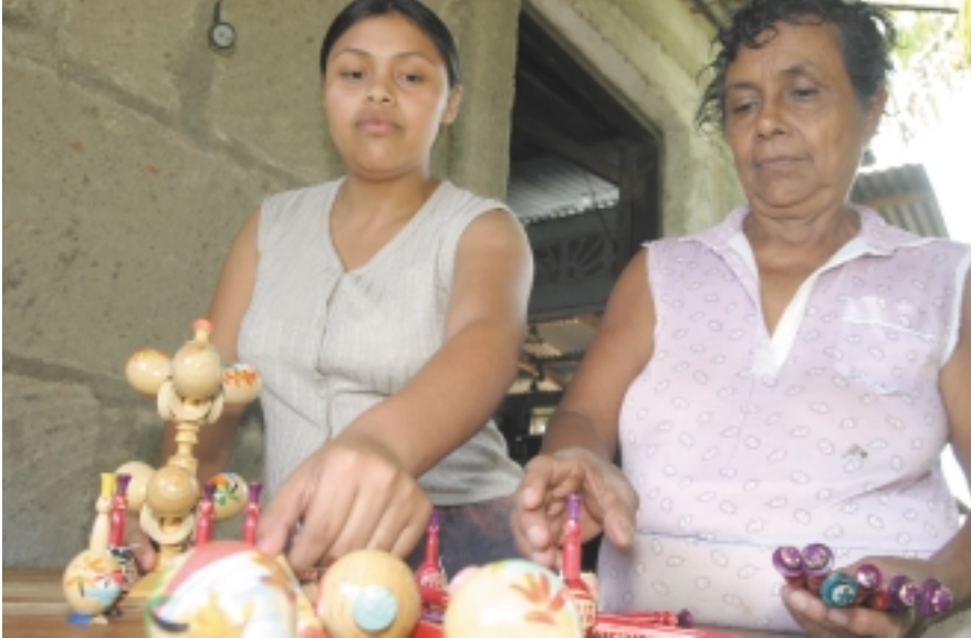
Women at a small toy manufacturing business assisted by ADIM.