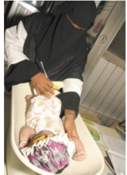
A female health worker weighs a baby.