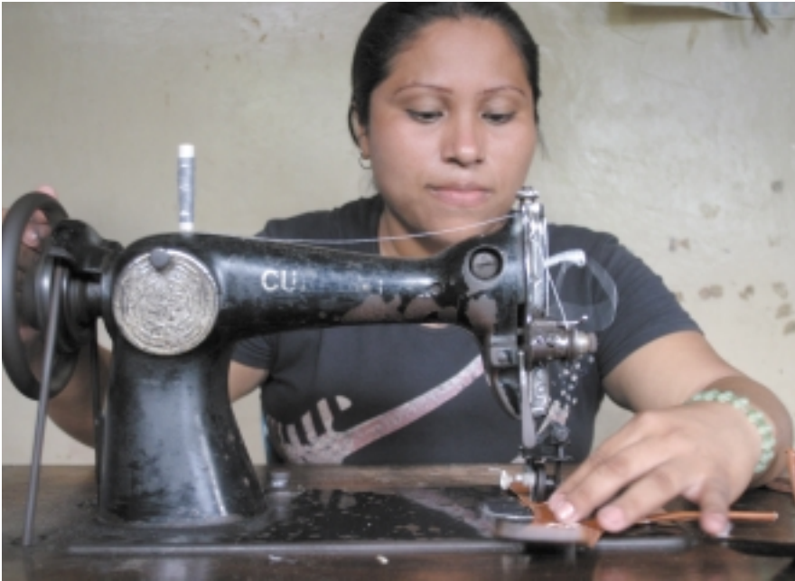
A woman at a sewing project, one of a number of small businesses seeking to empower women

The US-backed centre-right National Opposition Union defeated the FSLN. Since the 1996 elections, the Liberal party has been in government, although the president from 1996 to 2001, Arnoldo Aleman, is currently awaiting trial on charges of corruption, fraud and embezzlement.