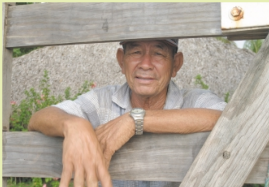
Breaking down the barricades of machismo: a fisherman in Nicaragua.