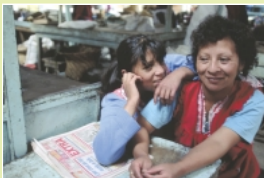
Two women at Cuenca market: the radio programme will help raise awareness about HIV and AIDS among Ecuadorian women.

I N ECUADOR the numbers of HIV positive people and of AIDS cases have grown over recent years. The coastal province of Guayas has nearly 90 per cent of the cases in the whole country. As in other countries, at first most of those affected were men who had sex with men, sex workers and their clients. But now most cases affect the wives and partners of those men – women who do not generally know the risk they are running and, for cultural reasons, do not ask their sexual partners to use condoms. The prognosis for Ecuador is that the epidemic will continue, mainly in groups like young people and women, who have less access to information on how to protect themselves.