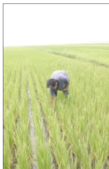
An organic rice farmer in the Philippines: organic agriculture is under threat from the promotion of GM crops.

To read the letter in full, to read CIIR's position paper on GM, and/or to see a draft letter that you can use to write to the Vatican, go to www.ciir.org and click on news , or use the search facility (keyword 'Vatican').