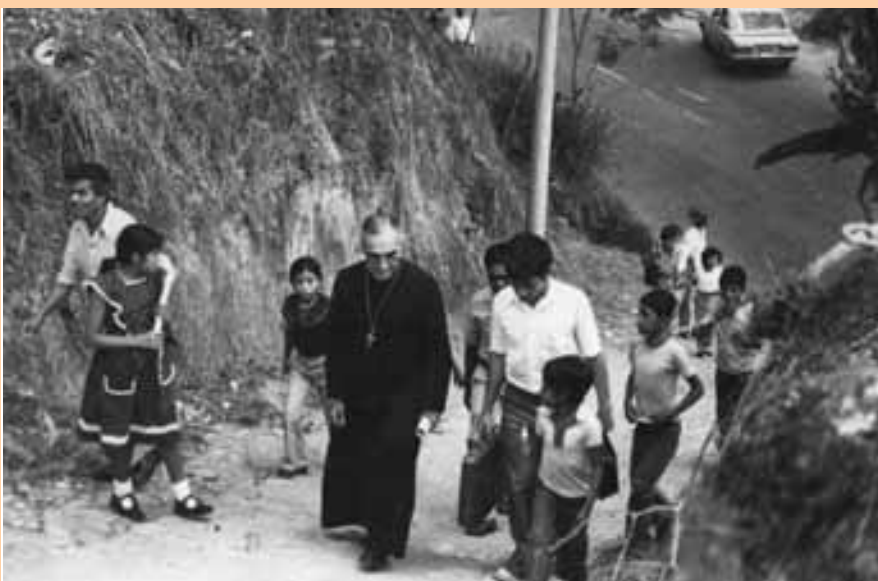
Archbishop Oscar Romero visiting a poor area of San Salvador.

A new charity, the Archbishop Romero Trust, has been founded to celebrate Romero's life and death in memorial liturgies, to foster study of his life and teachings, and to raise money to finance projects that continue his work for social justice and human rights in Central America. A brochure for the Trust is enclosed with this edition of Interact and you are warmly invited to sign up as a 'Friend of Romero'.