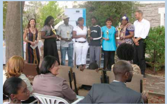
Winners of the first ever Human Rights Awards in Namibia for combating gender-based violence.

Although it will take many more years before gender equality is the reality in most women's lives, there are signs of hope. A male participant in a workshop last year on the laws on domestic violence, rape, child maintenance and inheritance told me: 'Since I have been learning about these things I have totally changed. I help my wife at home and our marriage is much happier.'