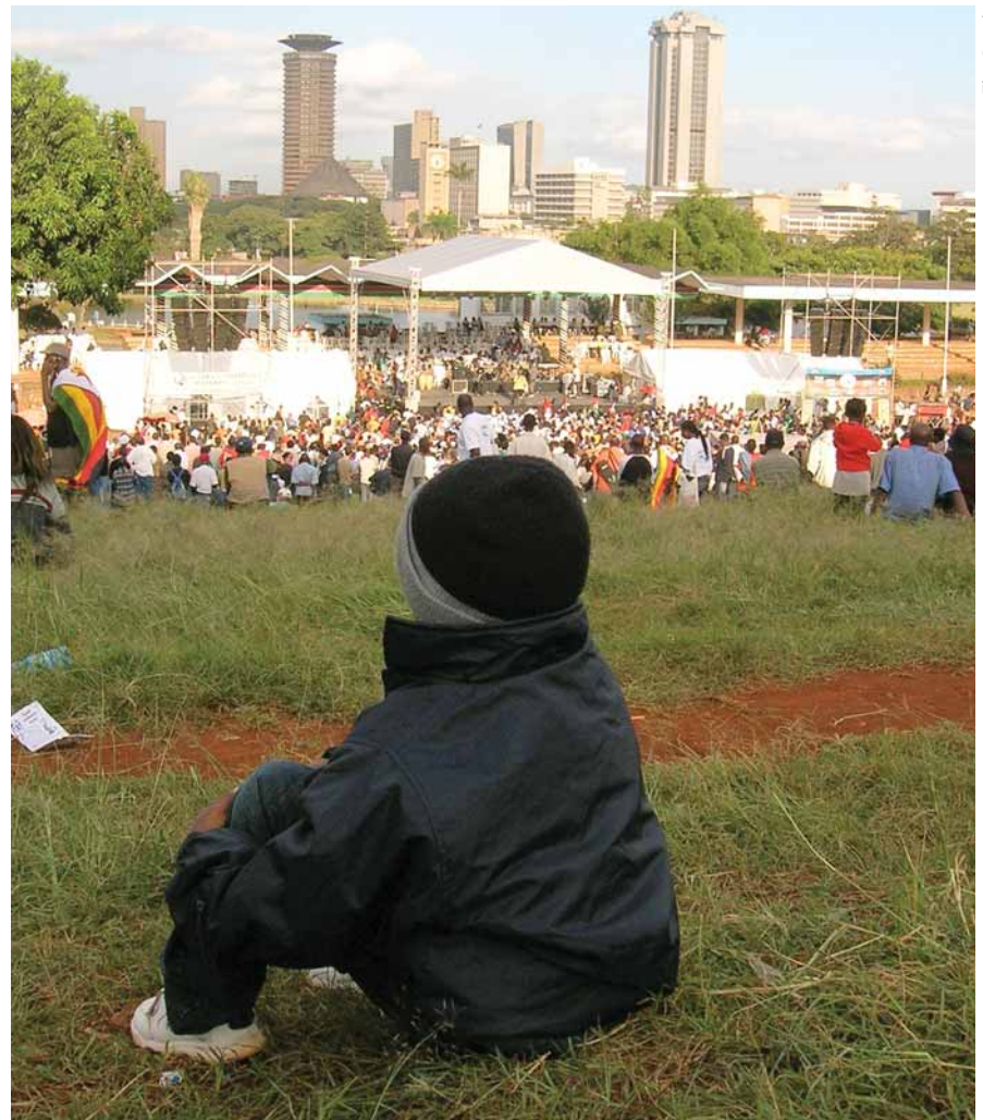
Alone in the crowd: a child at the World Social Forum in Nairobi.

Our consumerist culture requires that we live in a constant state of dissatisfaction. Happiness must always be just out of