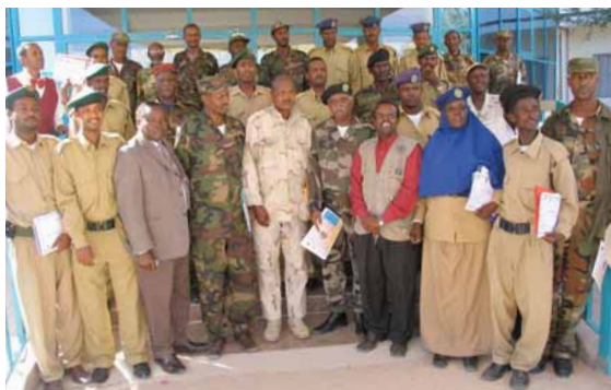
Participants in the Somaliland uniformed services HIV and AIDS workshop.

ATTITUDES ABOUT HIV AND AIDS among police, prison and army officers in Somaliland are beginning to change thanks to a pioneering series of workshops organised by Progressio partner organisation the Hargeisa Youth Development Association (HYDA).