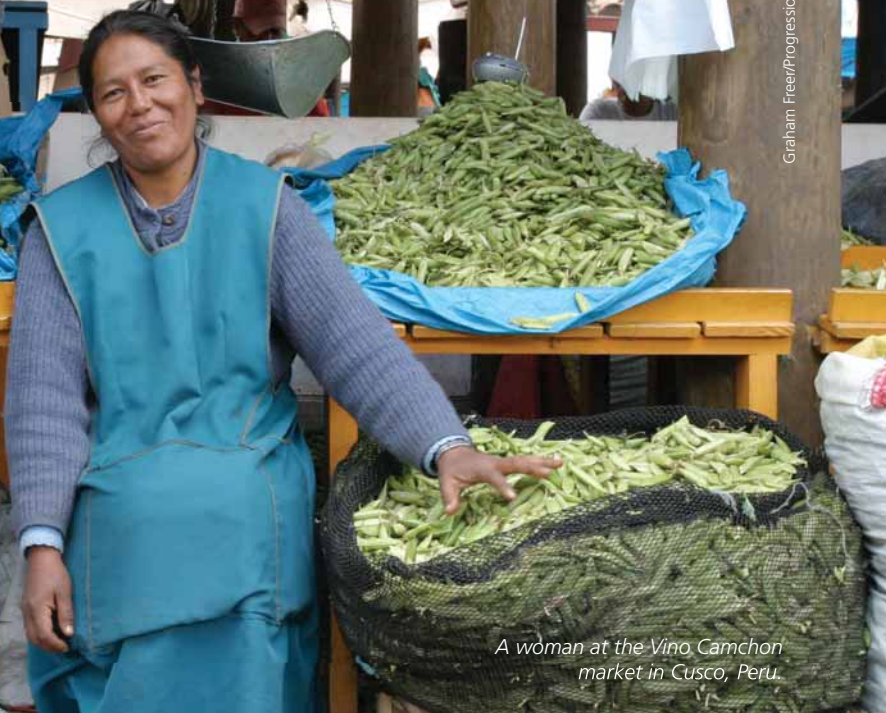
A woman at the Vino Camchon market in Cusco, Peru.

More than one billion people worldwide live below the poverty line, earning less than $1 per day (World Bank World Development Indicators 2006 ). And where there is poverty, women are the most affected, especially those caring for children. At Progressio, we believe that without gender equality, poverty cannot be eradicated. This is why we make sure that all our projects are sensitive to issues of gender equality and help promote the empowerment of women.